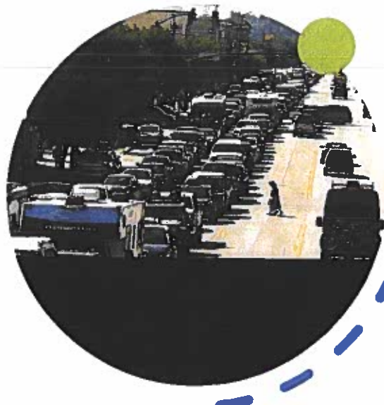
Wyoming 2017, Denver Post